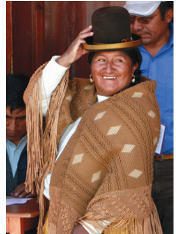
A Bolivian woman prepares to vote on a new constitution. The Carter Center works to strengthen democracy in the region.

The Americas Program has had an impact throughout the Western Hemisphere.