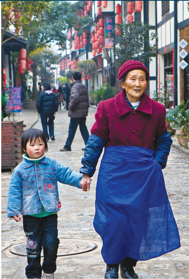
Carter Center projects in China aim to keep the country and its citizens engaged in the wider international community.

In 2000, the China Program helped launch a website on villager self-government in China that quickly became one of the most comprehensive websites on grassroots democracy in China. Two years later, building on its decade of work monitoring China's village elections and helping standardize these elections' procedures, the Center launched chinaelections.org , which became the most-visited political reform portal inside and outside China. In 2008, the China Program and the Center's Access to Information Program jointly launched chinatransparency.org . And in 2013, the program launched the uscnpm.org website to provide updates on a wide range of topics related to U.S.-China relations, including foreign policy, economy and trade, and social media.