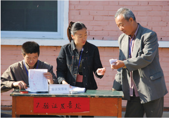
Residents of Shidong village prepare to vote in local elections. One of the Carter Center's early involvements in the country was helping it organize and administer village-level elections—the equivalent of city councils in the United States.

President Carter's decision to normalize the relationship between the United States and the People's Republic of China in 1979 changed China, the United States, and the world. The Carter Center's China Program is dedicated to preserving this legacy and advancing U.S.-China relations by building synergy between China and the United States on issues of global importance—fostering greater cooperation between them in other nations, providing resources and scholarship, and nurturing the next generation of young leaders who can shape the critical U.S.-China relationship to be a cornerstone of global peace and prosperity.