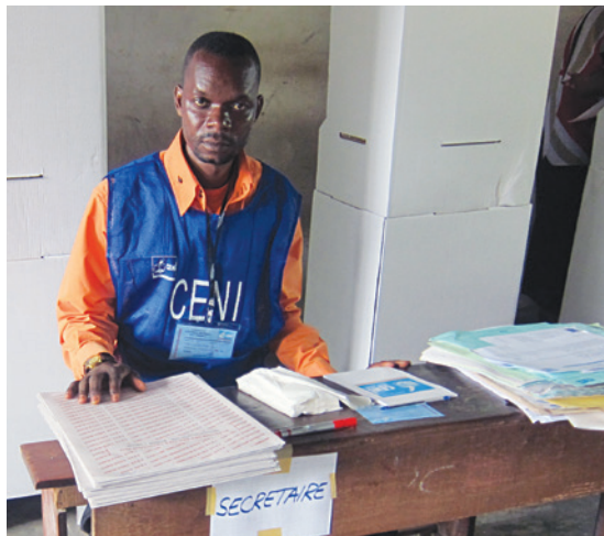
An election worker awaits voters in the Democratic Republic of the Congo. The Carter Center works in the country to strengthen democracy by supporting and training citizen election observers, activists who are working to advance respect for human rights, and local groups seeking reforms to enable the Congolese people to benefit from their country's natural resources, particularly its mineral-rich mines.

Assessments by organizations that monitor elections in emerging democracies play a central role in shaping perceptions about whether an election is genuinely democratic. The Carter Center has been a pioneer of election observation, monitoring more than 100 elections in Africa, Latin America, and Asia since 1989 and forging many of the techniques now common to the field. The Center must be invited by a country's election authorities and welcomed by the major political parties to ensure it can play a meaningful, nonpartisan role. In the months before election day, observers analyze election laws, assess voter education and registration, and evaluate fairness in campaigns. On election day, the presence of impartial observers reassures voters that they can safely cast a secret ballot and sometimes deters interference or fraud. Before, during, and after an election, the Center's findings are reported through public statements, both in-country and to the international community.