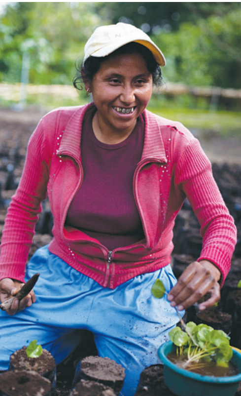
A Guatemalan woman works on a coffee plantation. A Carter Center study found that women in the Latin American country cannot access government information – to which they have a right – as easily as men.

Access to information is a fundamental human right, as enshrined in Article 19 of the Universal Declaration of Human Rights. Information is power. It helps people protect against governmental abuses and enables them to take steps to improve their lives, their families, and their communities.