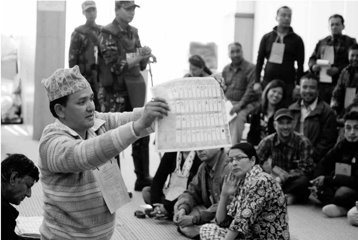
An election official shows a marked ballot to party representatives during the counting in Kathmandu.

out freely to voters and disseminate their message. In general, the campaign environment notably improved compared to 2008. Although the ECN came under criticism for not taking more stringent actions to curb violations of the code of conduct, many reported violations concerned relatively minor transgressions. There were, however, a number of more serious incidents involving supporters of competing parties, including acts of vandalism, obstructions of campaign activities, fights, and serious assaults.