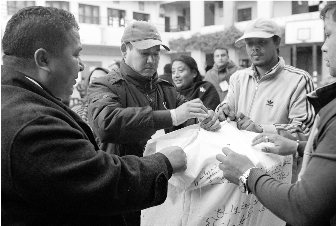
Poll workers seal a ballot box for transfer to a counting center. A cloth bag is put over the ballot box, which is then sewn shut.

first-past-the-post. However, it emerged as the fourth biggest party under the proportional representation system (and in the combined results) with 24 seats, a significant increase from the four seats that it won in 2008.