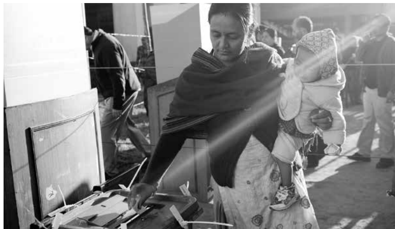
A woman casts her vote in Kathmandu.

numbers. The Carter Center commends this effort of including women in the electoral process and hopes it can be extended to other areas. However, it is necessary in the future to ensure that voter education volunteers receive sufficient and timely training to be able to conduct their tasks in an effective manner.