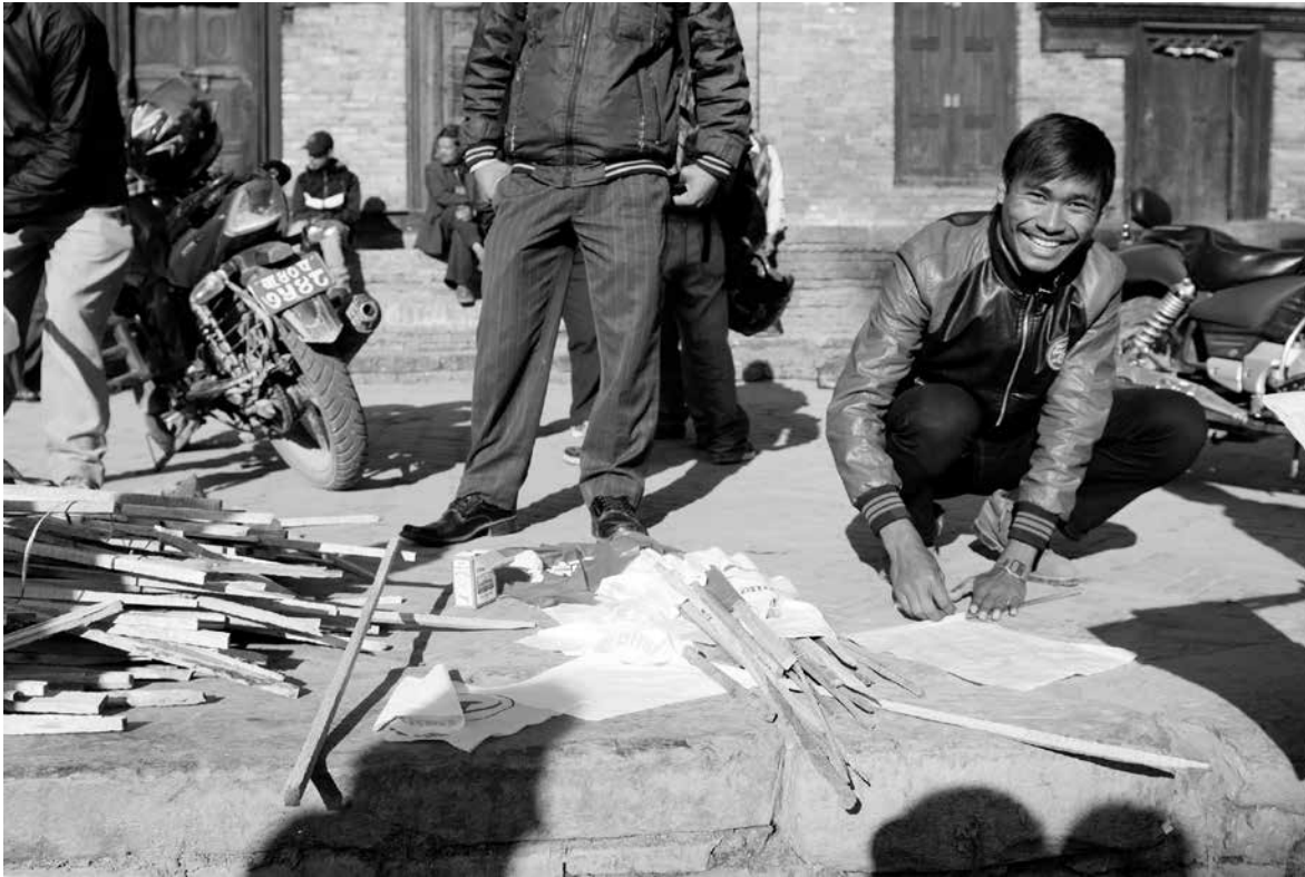
A Nepali man prepares flags for a political rally in Kathmandu. The flags were held up by motorcyclists as they wound through Kathmandu's narrow streets.

On Jan. 2, 2014, the ECN submitted the official results of the second constituent assembly election to the president. The Nepali Congress (NC) and the Communist Party of Nepal (Unified Marxist–Leninist; CPN–UML) emerged as the two largest parties in the 601-seat constituent assembly, with 196 and 175 seats, respectively. They were followed by the Unified Communist Party of Nepal (Maoist; UCPN–Maoist), which won 80 seats and lost its position as the largest party in the previous constituent assembly. With 24 seats, Rastriya Prajatantra Party–Nepal (RPP–Nepal) emerged as the fourth largest party in the constituent assembly due to its results in the proportional representation component of the electoral system, as it did not win any seats in the first-past-the-post races. Various Madhes-based parties won a combined 50 seats. In total, 30 parties of the 122 parties that contested the election are represented in the constituent assembly, along with two independent candidates.