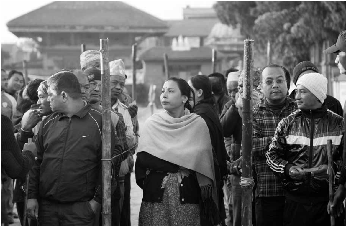
Voters wait in the queue for polls to open on election day in Bhaktapur Square.

the proportional representation lists is 50 percent. Based on articles 13 and 33 of the interim constitution, electoral law also expands the definition of the special categories to include people with disabilities, poor farmers, and laborers.