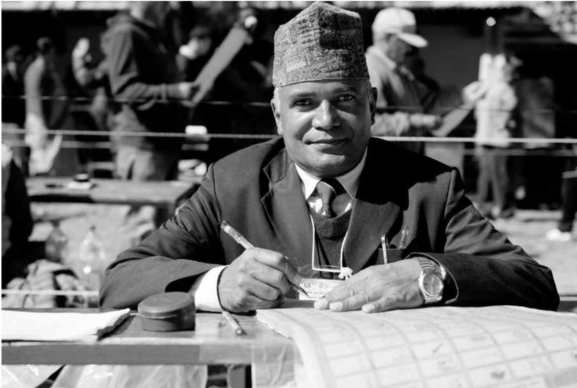
The head of a polling center in Kathmandu. "It is a great day," he said.

the Nepal Army remained a highly contentious issue until its eventual resolution in April 2012. 6