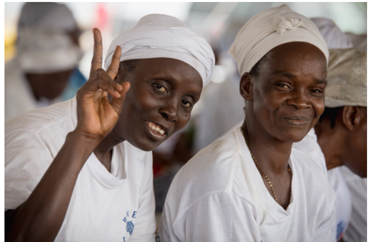
A woman in Liberia flashes the peace sign. The Carter Center has worked to help establish rule-of-law and mental health infrastructure in the country following two civil wars.

Liberia endured two civil wars in the 1990s, and the Center helped bring about an enduring peace through mediation, then assisted in creating the environment to rebuild. We observed national elections and implemented programs to support access to justice and to information. And we are assisting the country as it builds a mental health care system from the ground up, crucial in any country but especially one where the wounds of war are still fresh.