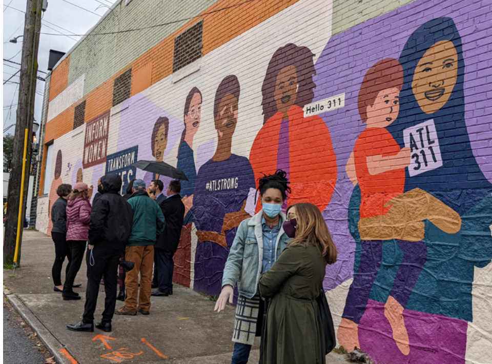
A mural in Atlanta, Georgia, publicizes the city’s 311 phone number, which provides access to non-emergency city services. Atlanta is a partner city in the Carter Center’s global campaign to provide government information to women.