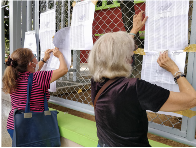
Venezuelans check the voter list for their names.

government interference, the courts halted vote counting in one state after early numbers showed that an opposition candidate was likely to win the governorship, claiming he was ineligible to run despite all evidence to the contrary.