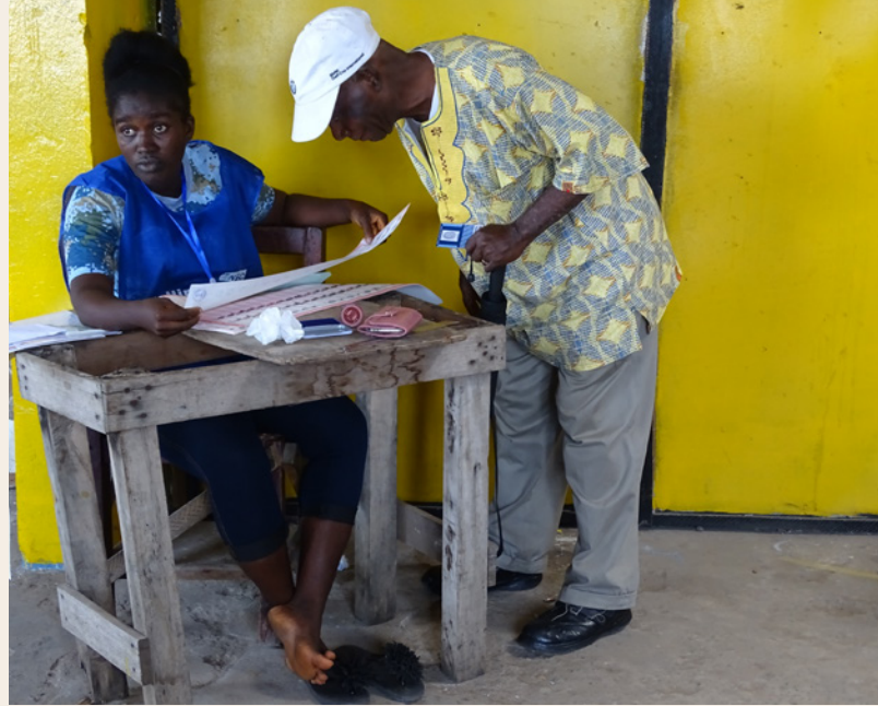
In a photo from a previous election, a Liberian man checks in at a polling station to vote. Under a grant from Sweden, The Carter Center is working with the Liberia Election Observation Network to further citizen monitoring of democratic processes.

An umbrella organization with national coverage and a presence in each of Liberia's 73 electoral districts, LEON has observed electoral and democratic processes since 2017, emerging as a recognized and respected voice on election-related issues in Liberia. The organization has built a reputation for increasing government transparency, encouraging citizen engagement, building confidence in the Liberian government, and supporting peaceful elections. LEON's