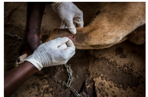
Guinea worm infections in animals, such as the dog seen here, have made eradication efforts more challenging in recent years.

As for Guinea worm infections in animals in 2021, Chad reported infections