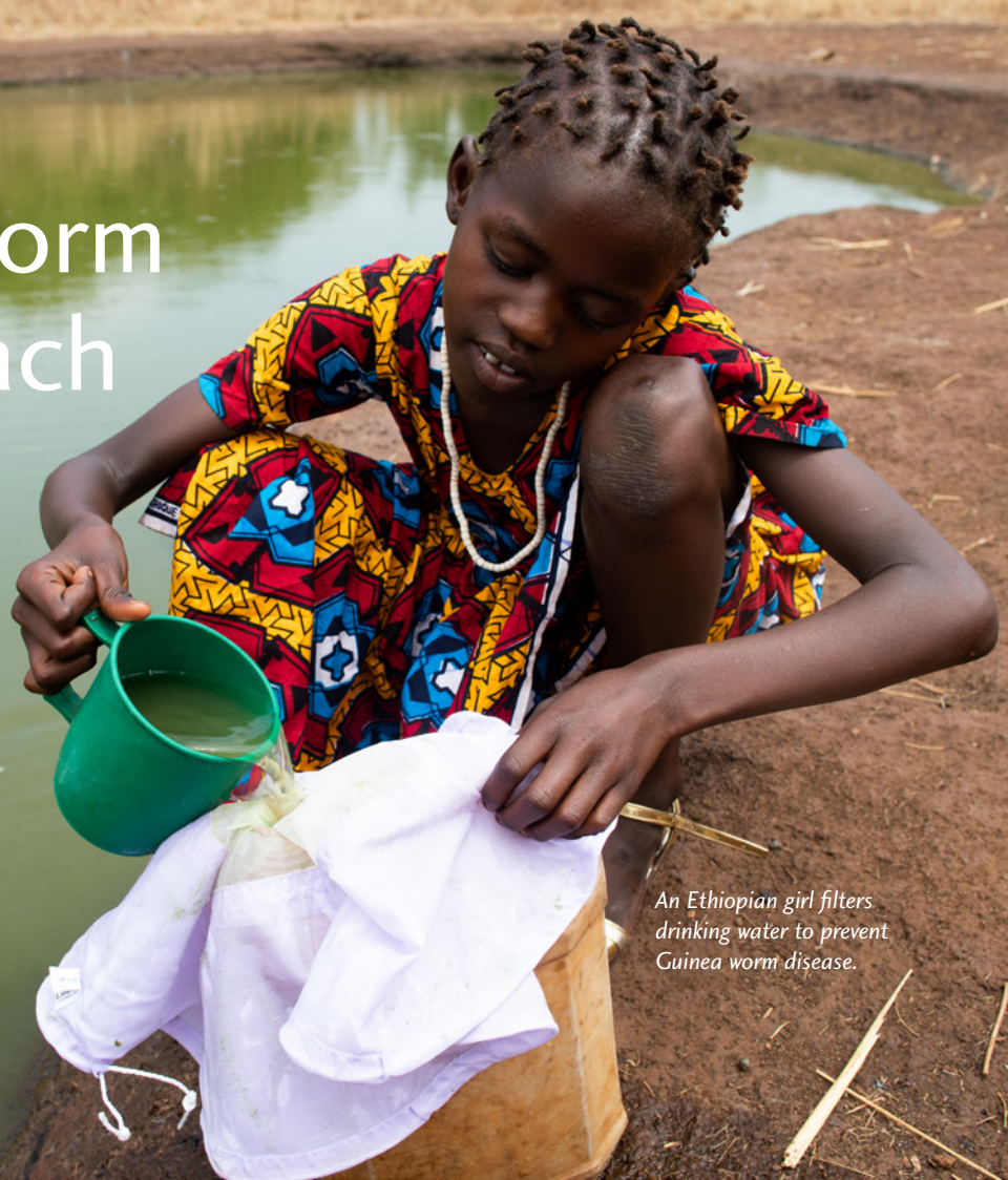
An Ethiopian girl filters drinking water to prevent Guinea worm disease.

Just 15 human cases of Guinea worm disease were reported in four countries in 2021, the lowest number ever recorded. When The Carter Center started leading the global eradication campaign in 1986, there were an estimated 3.5 million cases in 21 countries.