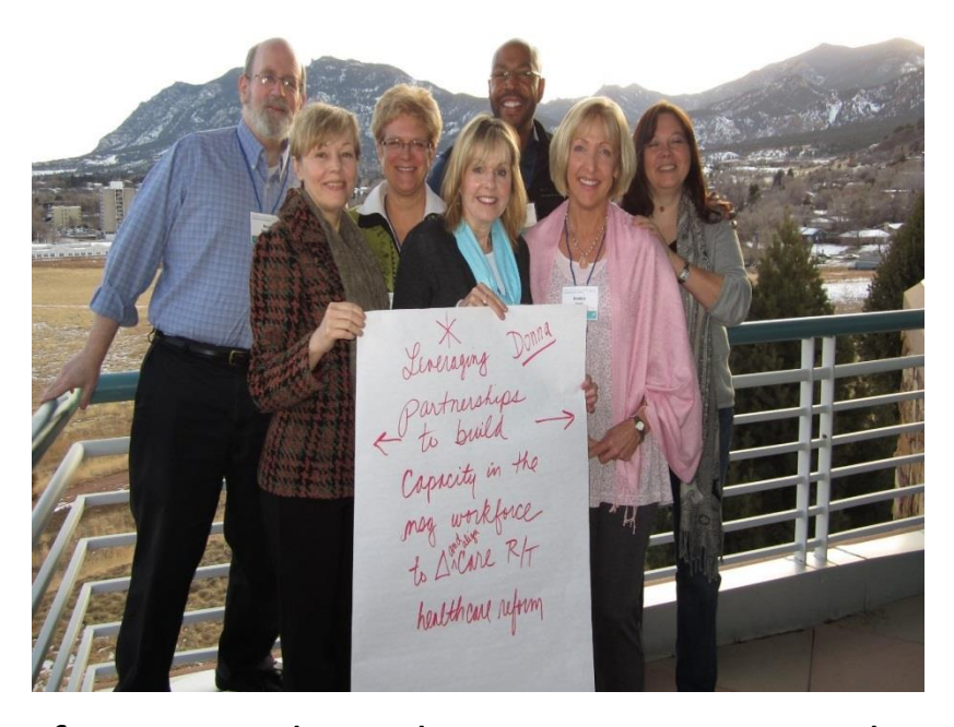
Transformation through Innovative Partnerships Team (TIP)