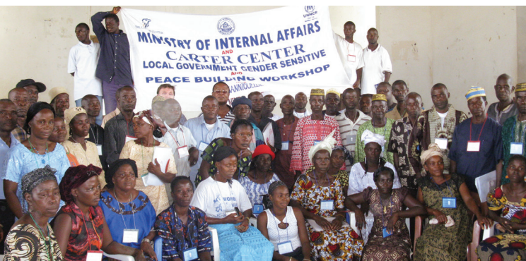
In 2009, partnering with Liberia's Ministry of Internal Affairs, the National Traditional Council, and the Ministry of Gender, The Carter Center held workshops on strengthening rule of law and expanding women's role in governance.