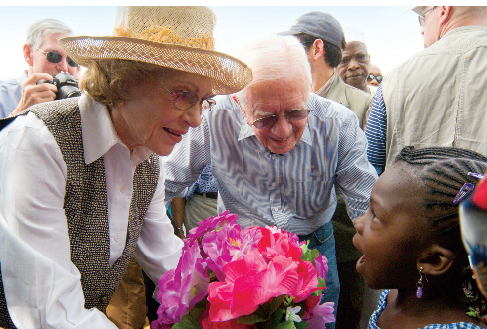
Left: On a 2007 trip to Ethiopia to review the Carter Center’s health programs, President and Mrs. Carter are welcomed with flowers by a local girl.