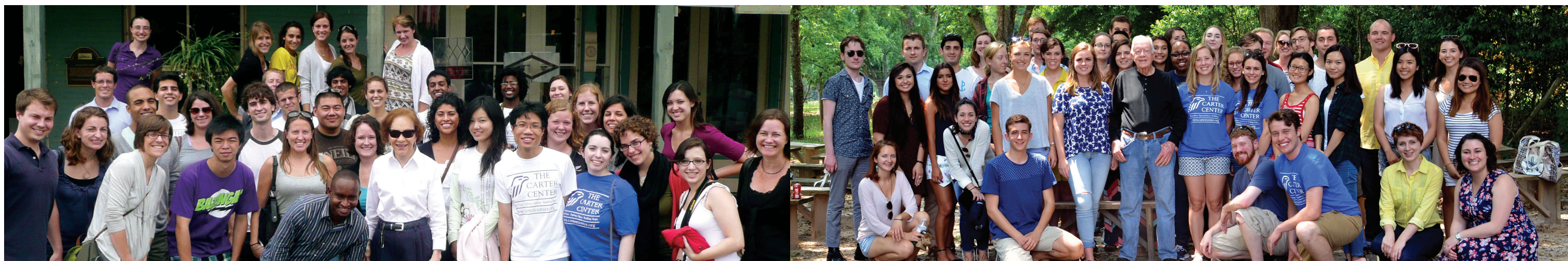
Left to right: The Carter Center's summer 2011 interns visit Mrs. Carter (center) in Plains, Georgia.