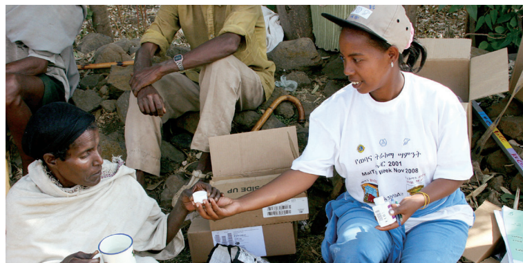
Left to right: 2008, a health worker distributes azithromycin to treat trachoma in Ethiopia. A student displays the results of his schistosomiasis test in the Ndinjor community of Nigeria. Mrs. Carter meets community members in Tingoli, Ghana. President Carter comforts a Ghanaian girl as she has a Guinea worm removed.