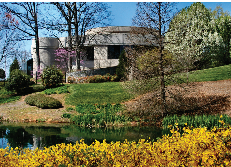
View from the Japanese garden at The Carter Center, Atlanta, Georgia.

The Carter Center has become a great and respected institution. Its fabric always has been inspired by the Carters, but as an institution it can and will continue with effective programs around its cardinal principles, even without their personal involvement. Its governance structure with Emory is sound and mutually beneficial to both institutions. The center's mission is well established, it has a tradition of effective leaders, and the center has a solid financial base on which it may continue to evolve and provide effective programs to benefit people around the world—all based on the values embedded deeply by the founders, Jimmy and Rosalynn Carter.