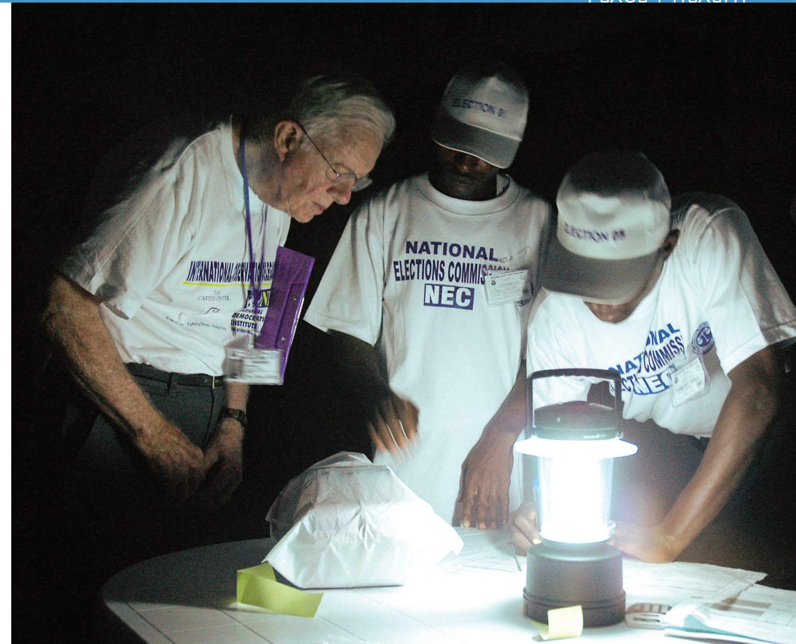
President Carter observes vote counting in Liberia in 2005.