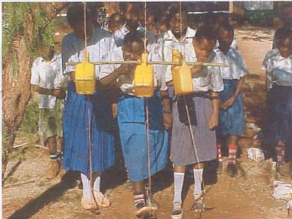
In many schools face washing is done before pupils enter classrooms

This chapter explores reasons for face washing, construction and use of latrines. As children mental development through formal education requires, apart from other things, children to be able to associate things and see the benefit in order to willingly adopt a desired behavior, this chapter give an overview of the association between trachoma on one hand and face washing, personal hygiene and the need for environmental change on the other