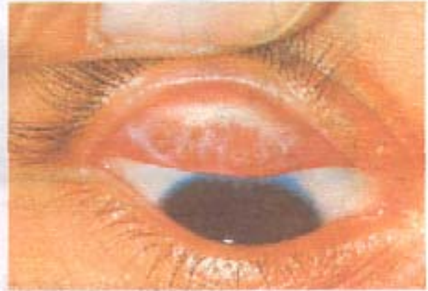
Trachomatous scarring (TS)