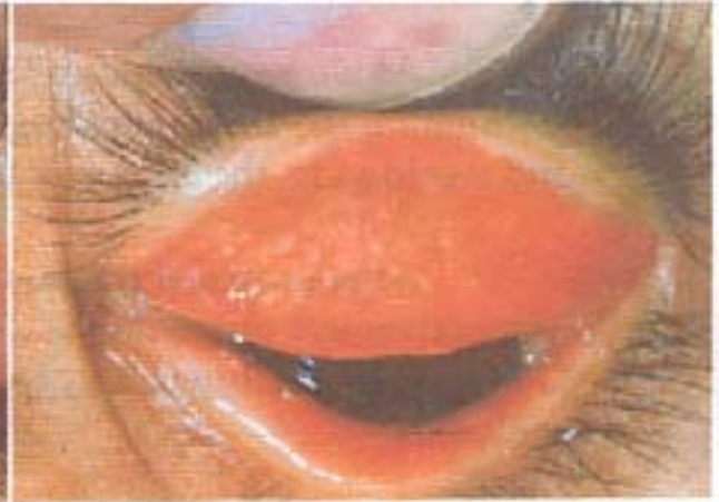
Trachomatous inflammation-follicular (TF)