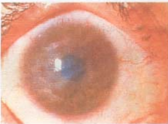
Corneal opacity (CO)