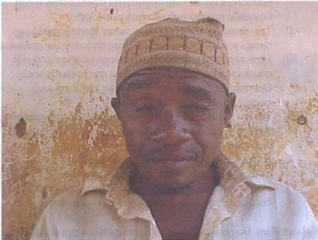
A TT patient with eyelashes rubbing the eyeball causing much discomfort

This is the fourth sign. It occurs when the scarring causes the inner lining of the eyelid to thicken and the shape of the eyelid to change. This pulls the eyelashes down towards the eyeballs. The eyelashes then rub on the eyeball causing much discomfort.