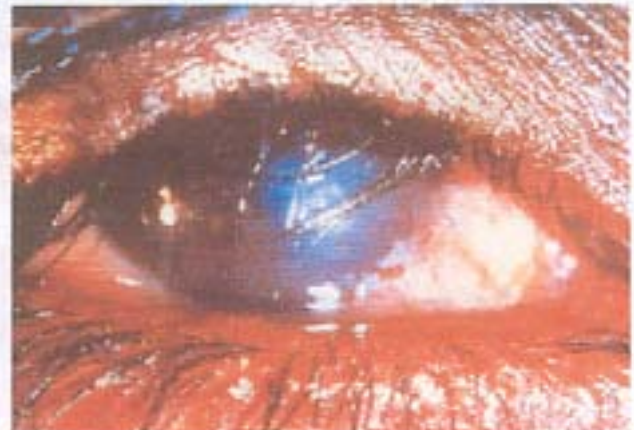
Trachomatous trichiasis (TT)