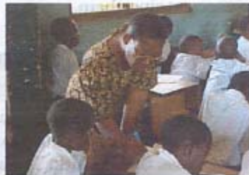
Children are most vulnerable to and are at high risk of trachoma infection. They really need help