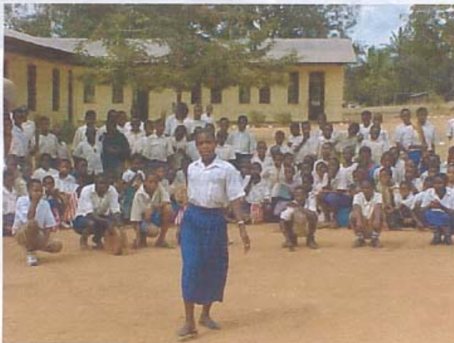
The use of school drama groups has been instrumental dissemination of trachoma messages not among school children alone but also to members of community

After that, school children and school environment at large become so instrumental in developing critical awareness, raising of consciousness, and stimulating people to think how they can change their behavior and environment. School children can do all these through songs, drama, puppets and drawings during community special days or school health days.