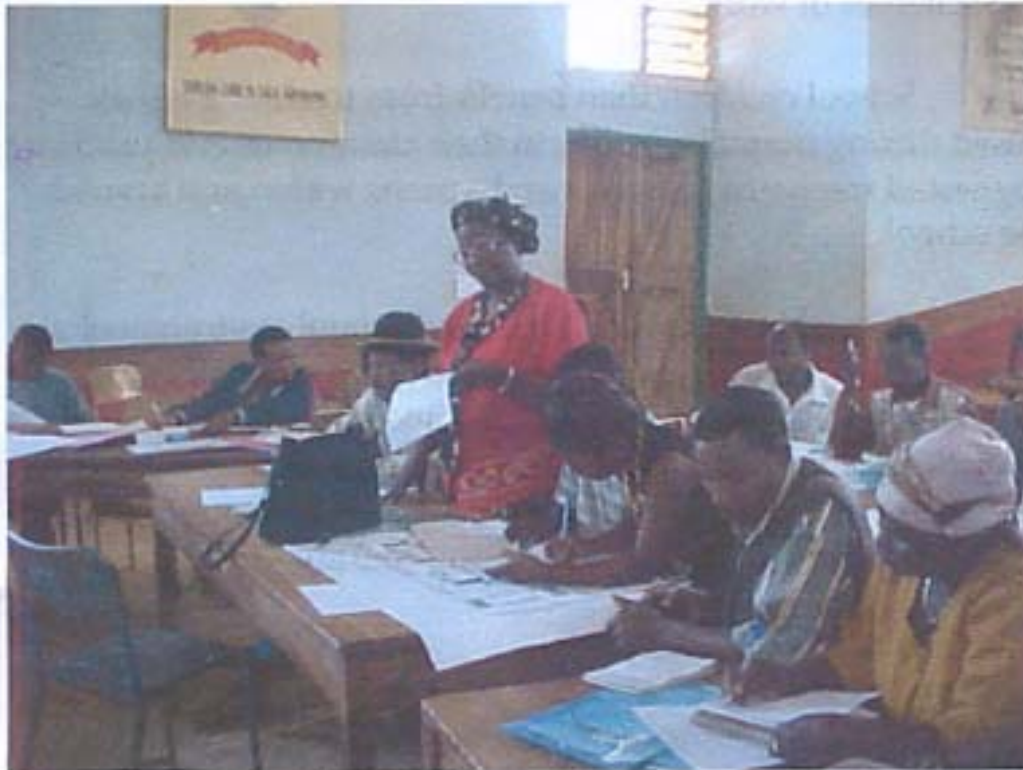
Active participation during school health teachers' trachoma workshops

In addition to accommodating the strategy the program works to reproduce more health and trachoma educators i.e. teachers and school children.