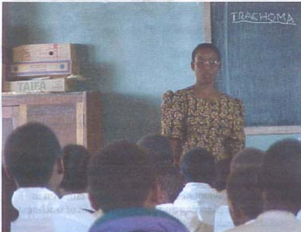
Trachoma messages can easily be reinforced across the teaching curriculum