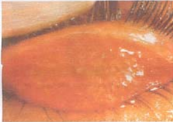
Trachomatous inflammation-follicular and